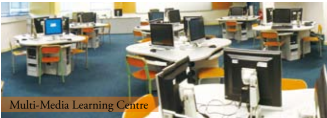
Multi-Media Learning Centre