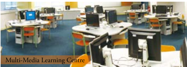
Multi-Media Learning Centre