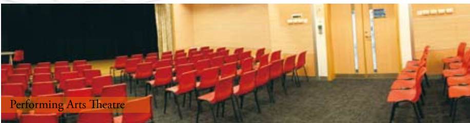
Performing Arts Theatre