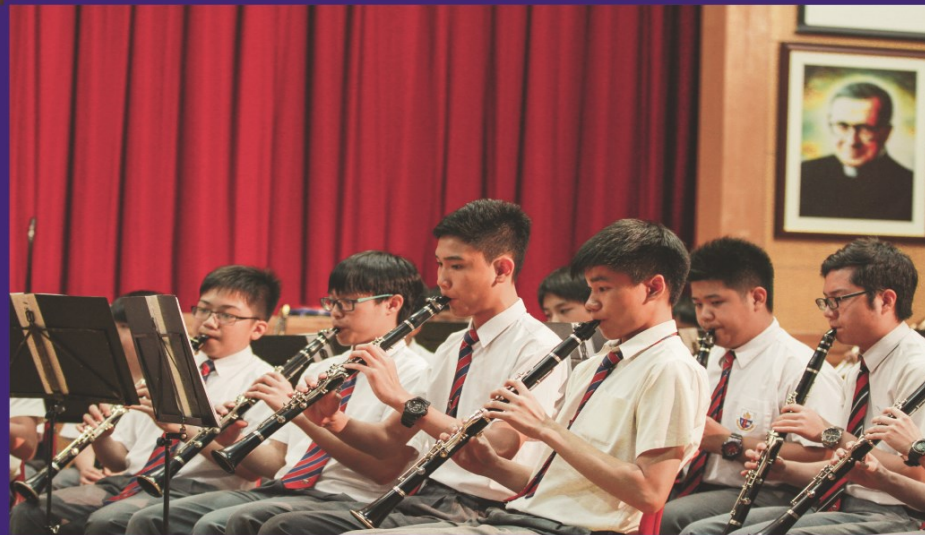
Tak Sun Secondary School Class of 2018 Speech Day