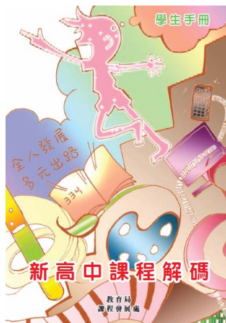
Decoding the New Senior Secondary Curriculum – Student Handbook (EDB, 2009)

The “HKDSE Examination” and the “HKDSE Examination – Information on School-based Assessment” booklets have been published recently by the Hong Kong Examinations and Assessment Authority (HKEAA). These booklets provide students and parents with an overview of various aspects of the new examinations, including the structure, the methods of assessment and the report system. These booklets would be distributed to Form 4 students and parents by the end of November.