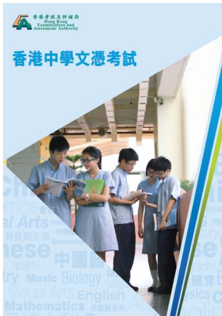
HKDSE Examination (HKEAA, 2009)