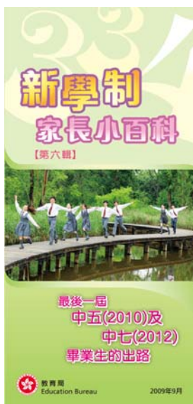
“334” New Academic Structure – Useful Tips for Parents (EDB, 2009)

Due to the impact of the NSS implementation, the EDB has also issued some leaflets for the parents of the last batch of students under the existing educational system so that both parents and students can understand more in the preparation of the students' future career plans. For the other batch of NSS students, some newsletters are available for students so that they can get more information about the NSS.