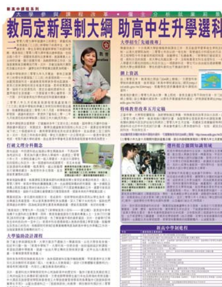
News articles on New Senior Secondary Structure (EDB, 2009)