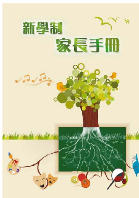
New Academic Structure – Parents Handbook (EDB, 2009)

Another booklet from the EDB titled “Decoding the New Senior Secondary Curriculum – Student Handbook” aims at enhancing students’ understanding of the New Senior Secondary Curriculum and the learning opportunities provided, as well as their role as effective learners. Both booklets would be distributed to Secondary 4 students and parents by the end of November.