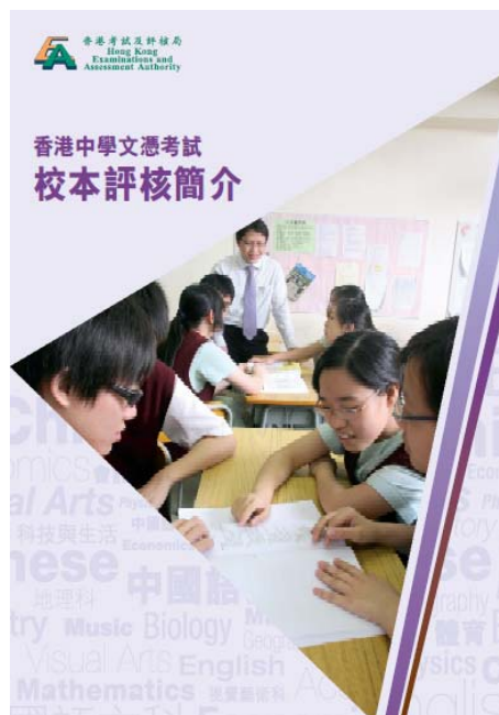
HKDSE Examination – Information on School-based Assessment (HKEAA, 2009)

Due to the impact of the NSS implementation, the EDB has also issued some leaflets for the parents of the last batch of students under the existing educational system so that both parents and students can understand more in the preparation of the students' future career plans. For the other batch of NSS students, some newsletters are available for students so that they can get more information about the NSS.